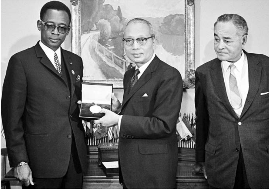
U.N. Secretary-General U Thant presents Joseph Mobutu (left), President of the Democratic Republic of Congo, with a United Nations 25th Anniversary Commemorative medal. At the right is Ralph J. Bunche, Under Secretary-General for Special Political Affairs, October 8, 1970.

lives, and they will stop it voluntarily... Most people accept circumcision blindly as an old custom. Three of my own daughters are circumcised, but the two younger ones are not. One who was not circumcised is already married and is bearing children. I believe that it should be left to the girls themselves to decide. I do not want any of my daughters forced into either circumcision or marriage or forced to forgo them, against their desires." (1941:64–65)