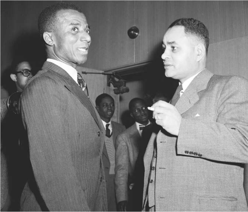
Sylvanus E. Olympio of Togoland, left, spokesman for the All-Ewe Conference, and the first petitioner to appear before a full council of the United Nations, talks with Ralph J. Bunche, director of Trusteeship Division, before the 11th meeting of the Trusteeship Council. Lake Success, New York, December 8, 1947.

variety of relatively obscure sites: his Harvard dissertation; articles and book reviews published largely in Negro journals; thousands of photographs shot during episodes of field research in Dahomey, Togo, South Africa, Kenya, and on safari through Uganda, Congo, Tanganyika, and Kenya; travel notes chronicling his research in Kenya and South Africa; ethnographic film footage; plus the formal documentation of interest articulation by subject peoples collected during his directorship of the U.N. Trusteeship Council. Taken together, these materials constitute the elements of the paradigm that informed Bunche's Africanist scholarship. That paradigm—grounded in economic determinism—emphasized the problems posed by colonial policies, imperialism, and the changing status of the contemporary African population. For Bunche, these were the defining issues of late-colonial Africa. And with the conviction of a man who knows that he is right, he insisted that these matters should constitute the central terrain of modern African studies.