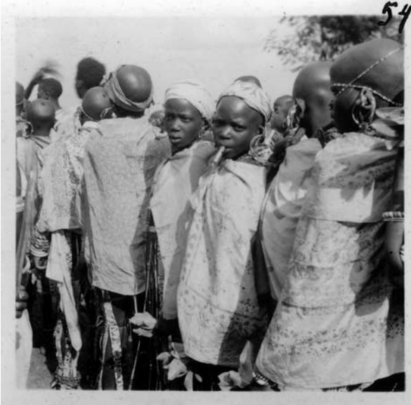
Photo taken by Ralph Bunche of Kikuyu girls at Githiga Market, in the Kiambu District of Kenya, as they await the final phase of their initiation ceremony, February 1938.

after three or four hours of rest that she begins to realize that something has been done to her genital organ. (1978[1934]:147)