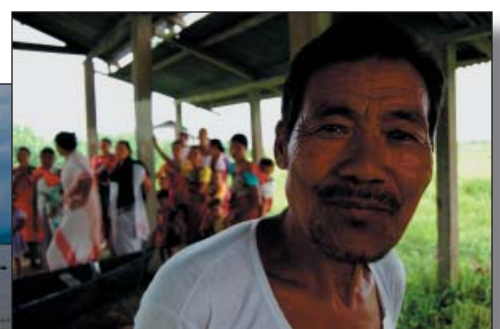
Resident of Dodhia at a local medical camp.