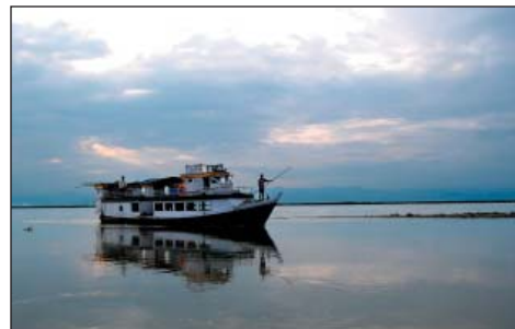
One of the boats for C-NES that travels to the saporis to run medical camps in Shanaz.