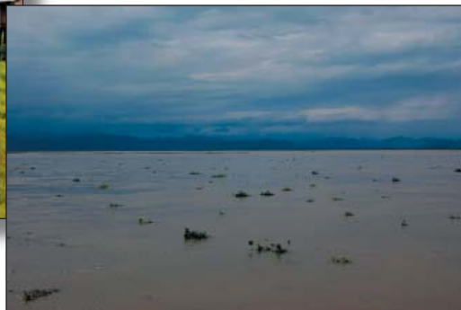
The Brahmaputra River during monsoon season. The plants are water hyacinth, which are a sign of flooding.