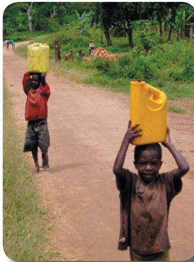
Children in Katebo Village, Uganda

AIDS has affected everyone. Each person in that room knows someone, if not themselves, who is HIV positive and/or has died from AIDS. Then he speaks to them on the following points: HIV, AIDS, and the difference between the two, the facts about HIV/AIDS, transmission, prevention, symptoms of infection, care for people with HIV, and how to use a condom. Finally, the children ask questions on pieces of paper and give them to us. Examples of questions that we received were: "How come I have AIDS and my brother doesn't?" or "Both of my parents died from AIDS, what are the odds of me being HIV positive, and do I have to get tested?" We answered a few there, and for the others we typed up the questions and answers and gave them back to the school in the form of a booklet.