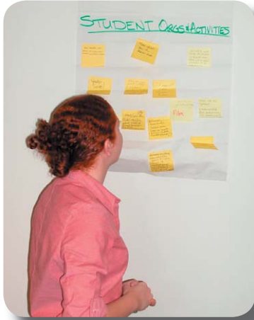
Students placed their ideas and comments onto posters at the IR Summit and Social