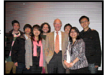
Graduate Students meet Professor Solow