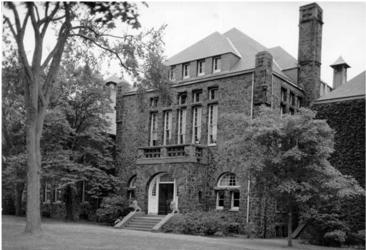
Barnum Hall, home of the Tufts University Department of Biology, circa 1925