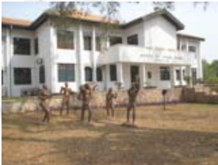
Kwame Nkrumah Complex, Institute of African Studies, University of Ghana. The university Art Museum is housed in this building